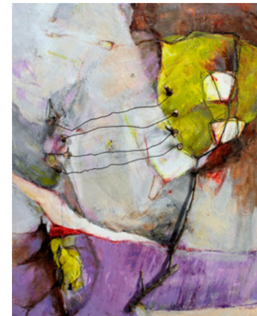
Andrea Huppert, Grounded , 2016, Encaustic, twigs and wire on panel, 30 x 24"; courtesy of the artist.

A cts of discovery and revelation, the works in EARTH BOUND boldly stir the imagination and awaken the senses. While inviting us to appreciate the marvels of our planet in a new light, their artistic interpretations encourage reflection of our relationship with the natural world and with each other. As astronaut Piers J. Sellers wrote soon after his fatal diagnosis of stage 4 cancer: “...I'm very grateful for the experiences I've had on this planet. As an astronaut I spacewalked 220 miles above the Earth. Floating alongside the International Space Station, I watched hurricanes cartwheel across oceans, the Amazon snake its way to the sea through a brilliant green carpet of forest, and gigantic nighttime thunderstorms flash and flare for hundreds of miles along the Equator. From this God's-eye-view, I saw how fragile and infinitely precious the Earth is. I'm hopeful for its future. And so, I'm going to work tomorrow.”